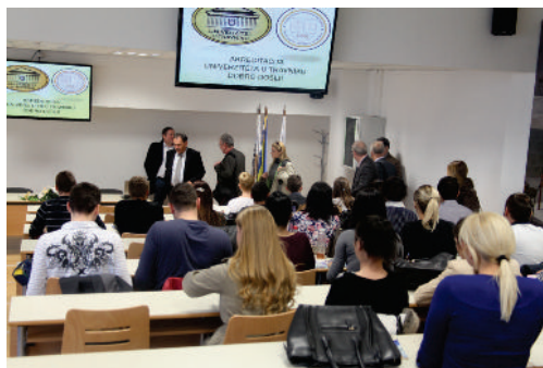
Expert Panel visited Faculty of Law