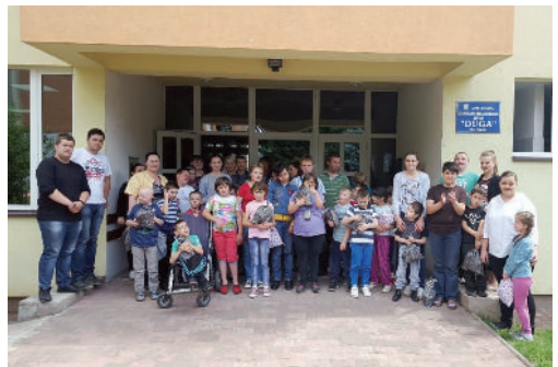
Student humanitarian projects