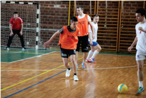
Student sports games

In addition to the educational process, the University establishes cooperation with public institutions and organizations, businesses enterprises, local communities, social, cultural and sports associations and other. Therefore, modern educational facilities and faculty study programs that meet requirements of the Bologna process are the main reasons for confidence and trust given by a large number of students.