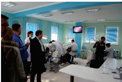
Expert Panel visited Faculty of Pharmacy and Health

The recommendation of the Expert Panel for accreditation of the University confirmed the results of self-evaluation report and an upward trend in student enrollment at the University of Travnik, which clearly indicates that the University of Travnik has become a recognized higher education institution, affirmed in the academic community of Bosnia and Herzegovina.