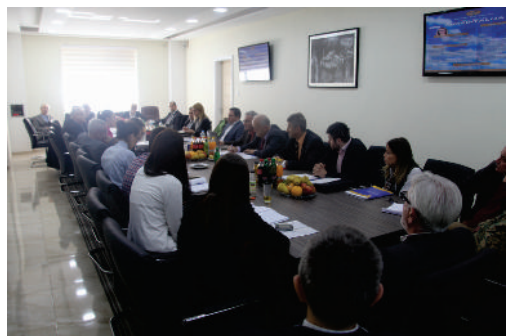
Expert Panel visited Faculty of Technical Studies