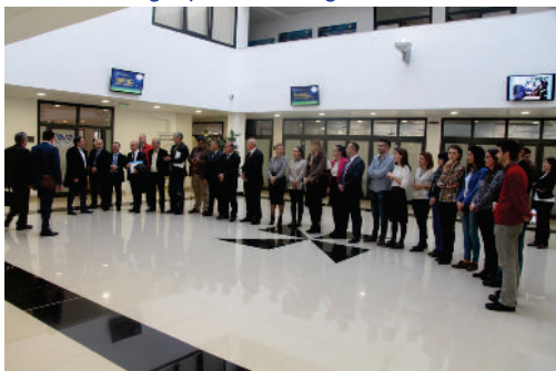
Expert Panel visited Faculty of Management and Business Economics