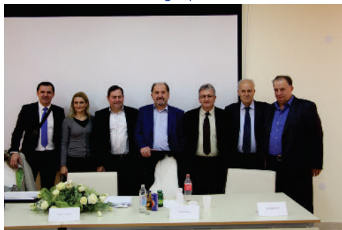
Expert Panel with the Management of the University