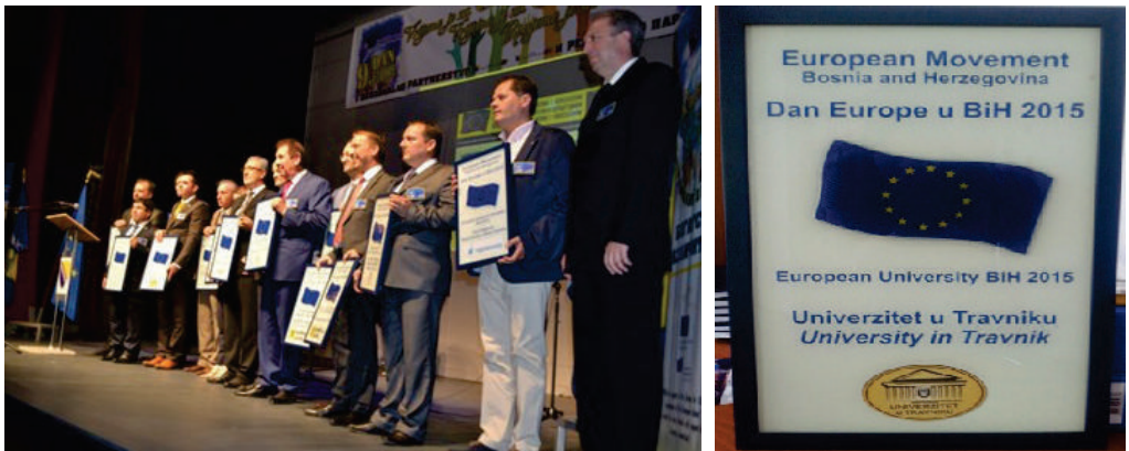
University of Travnik recieved the prestigious award and plaque as the best university in Bosnia and Herzegovina

Scientific Research and Research are the foundation of the quality of teaching at the University and is its inseparable unit, representing the fundamental right and duty of the academic staff.