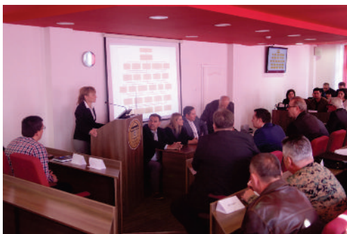
Expert Panel visited Faculty of Education

Acting according to formal procedures, University of Travnik completed the process of external evaluation. Expert Panel of national and international experts that perform evaluation and quality review, and give recommendations for accreditation of the University of Travnik found that University of Travnik meets all requirements for full accreditation and, consequently, gave its opinion and recommendation – to accredit the University of Travnik.