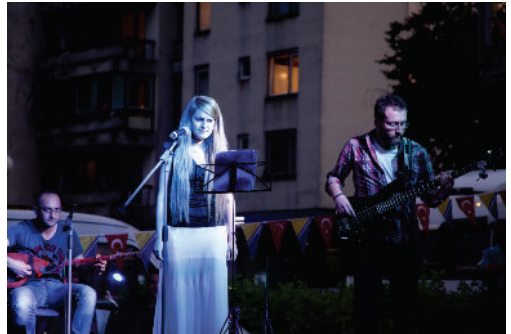
University Band Concert